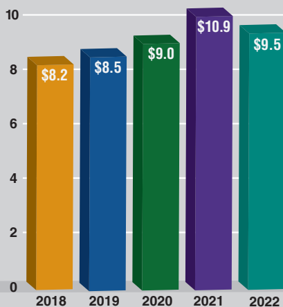
Total Market Value of Plan Assets (in billions) (As of September 30)

Annual Comprehensive Financial Report (ACFR) — DCRB's Finance Department completed our 2021 ACFR by the required due date of March 31, 2022. You can find a copy of it on our website at: www.dcrb.dc.gov , under publications and reports.